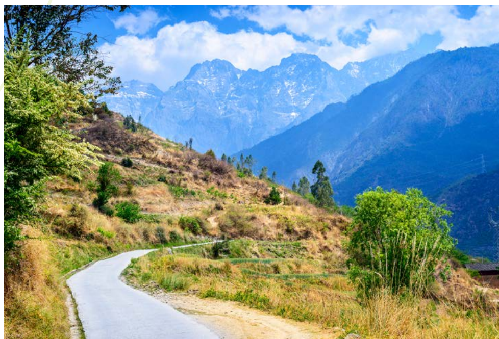
Tiger Leaping Gorge – Yunnan, China

Case summary In 2014, China launched the New Energy Development Strategic Action Plan (NEDSAP 2014–2020) setting a target to limit coal consumption at 4.2 Gt/year by 2020, which is estimated to represent 62% of the energy mix. The Plan is a Low Emission Development Strategy designed through a country-driven process and rooted in China's priorities, such as improving local air quality and addressing water scarcity issues. The ambition to limit coal consumption in China comes out of a commitment at the highest political level, contributing to the achievement of China's Copenhagen pledge of 40–45% reduction in carbon intensity compared to 2005 levels by 2020 and its Intended Nationally Determined Contribution (INDC) goal of peaking CO 2 emissions by 2030 at the latest. In addition, capping and decreasing coal consumption is a high priority in China's 13th Five Year Plan, which will be officially released in March 2016 at the annual National People's Congress. According to a recent study by Greenpeace (April 2014), cumulatively, the coal control measures could result in a reduction in coal consumption of approximately 350 million tonnes (MT) by 2017 and 655 MT by 2020, compared with business-as-usual growth. This translates into an estimated reduction in CO 2 emissions of about 700 MT in 2017 and 1,300 MT in 2020.