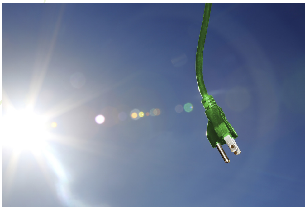
Energy supply