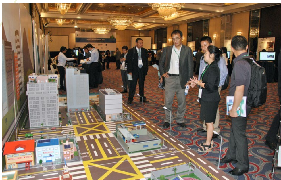
Model low-carbon, livable city display by the Philippines Climate Change Commission and USAID Philippines, at the open space session on "Tools and Practices for Implementing LEDS and Green Growth" October 1, 2013 at the Asia LEDS Forum, Manila.

The Philippines is a good example of political leadership and long-term vision for comprehensive and integrated climate policy demonstrated through: (1) the fact that the origins of climate policy initiatives are rooted in the national democratic movement which led to change in the political structure of the country; (2) substantial budgetary support despite financial constraints; and (3) the proactive approach to consult and take help in both improving the policies as well as implementing them from international agencies.