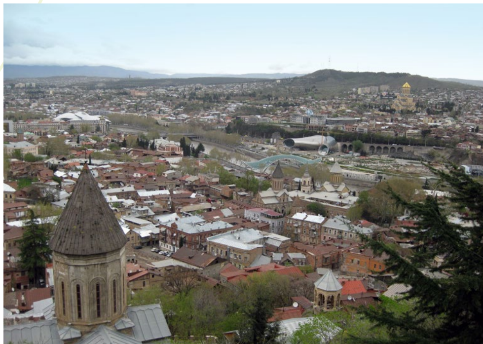
Tbilisi City, Georgia

Critical to the success of the development of the SEAPs were political commitment on national and local level, international financial support, technical assistance to local level & national coordinators, access to funds, motivated personnel and capacity building programs externally financed by the CoM.